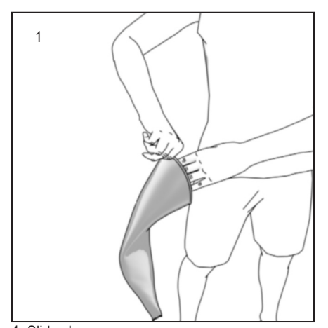
Slide sleeve on arm.

⚠ Warning: This device will not prevent or eliminate risk of injury. Do Not Overtighten. If swelling, pain, skin irritation, or an unusual reaction occurs, discontinue use immediately and consult your medical professional. Care: Hand wash using mild soap. Rinse thoroughly. Air dry only. Do not tumble dry.